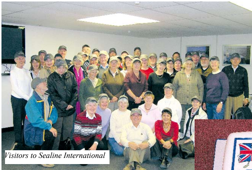
Visitors to Sealine International