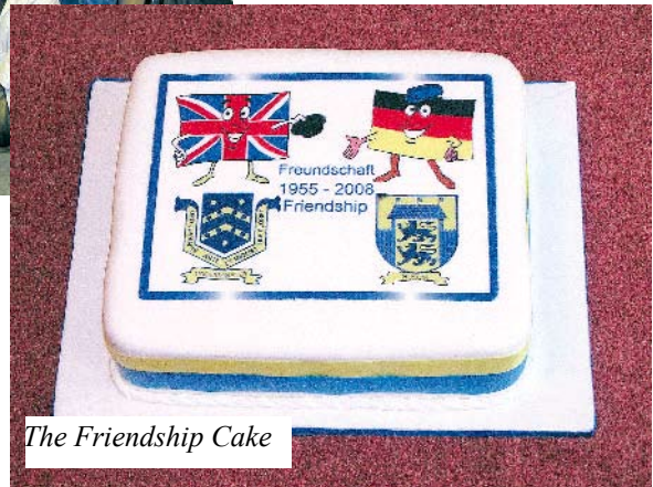
The Friendship Cake