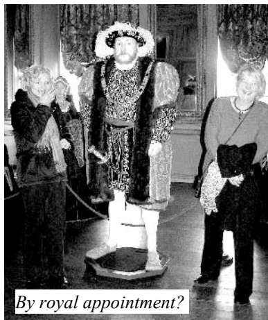
By royal appointment?

On Saturday morning 31 Husumers and 12 hosts travelled to Warwick Castle. The weather was kind and everyone was able to enjoy the magnificent castle and its grounds - with two lady Husumers even meeting Henry VIII and surviving the experience. Anyone who ventured into nearby Warwick town was even able to sample the "delights" of the Autumn Mop Fair before rejoining the coach and returning to