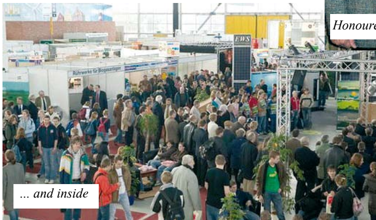
... and inside

1998 saw the completion of the extensive facilities at the Messehalle , to the north-east of the town, and this has become the centre for many shows, trade fairs and other events. But over recent years the HUSUMwind exhibition, in particular, has out-