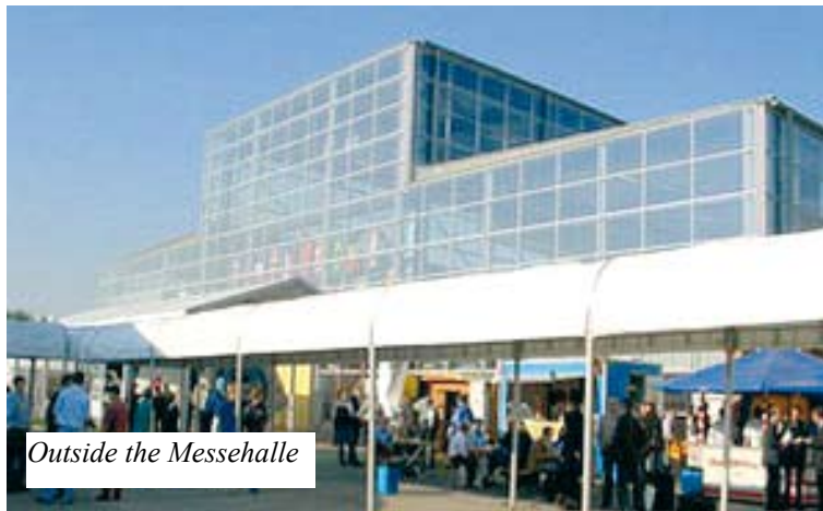
Outside the Messehalle

nicians for the wind energy sector and in the House of Future Energies renewable energy forms much of the programme.